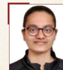
AIR 18 TANYUSHVI