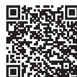
Webinar Session-IV 3 rd May 2020