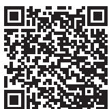
Webinar Session-II 5 th April 2020