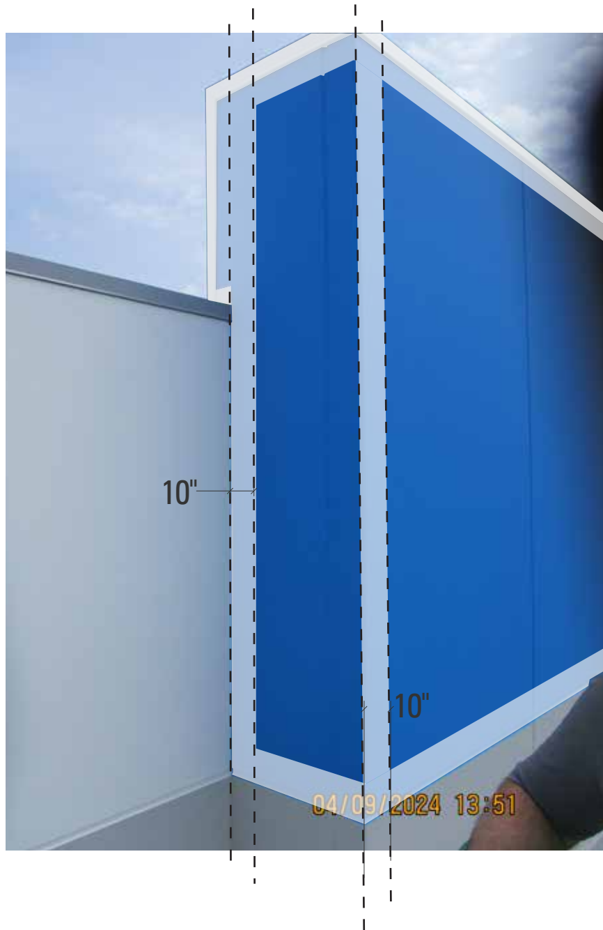
1 SIDE OF EAST ELEVATION FACADE PHOTO COMP