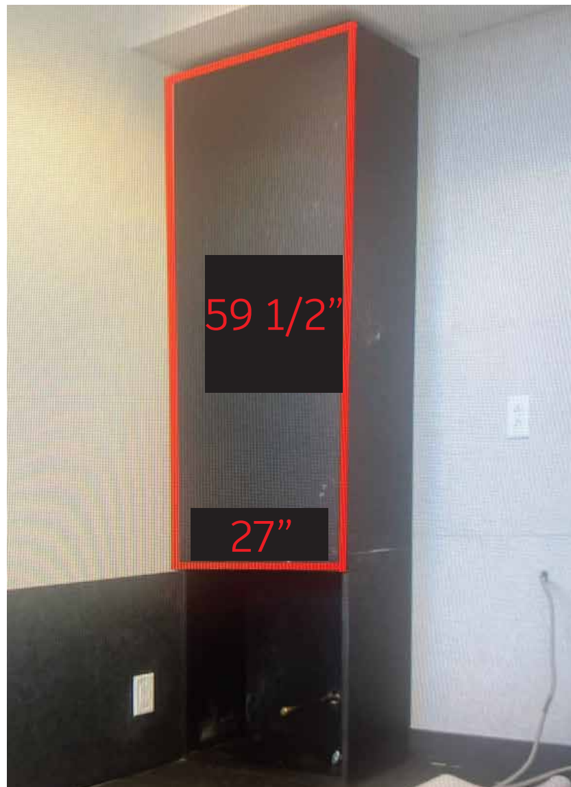
2 SPEC PHOTO AND DIMENSIONS