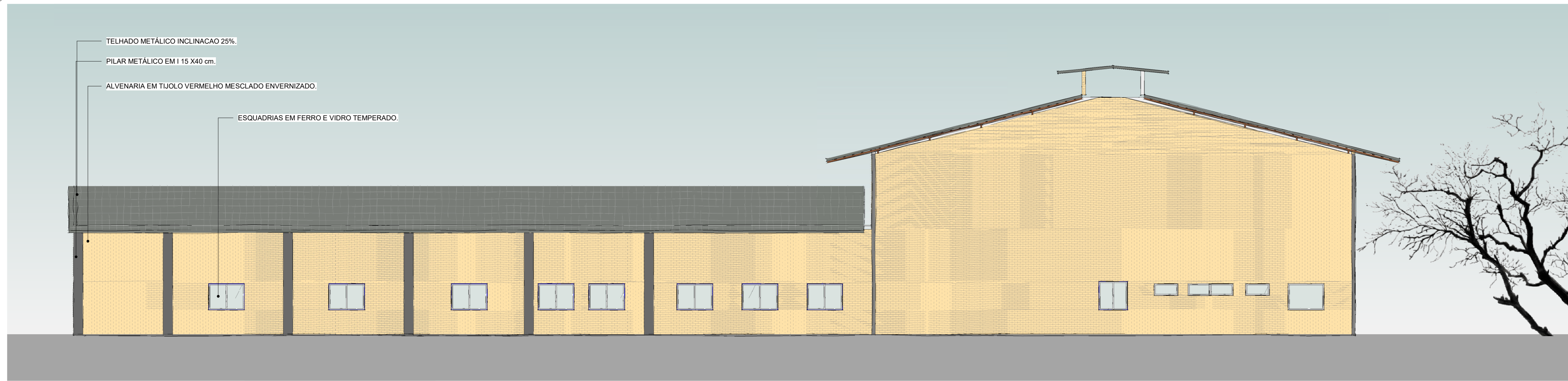
3 Elevation 4 - a ESCALA 1:100