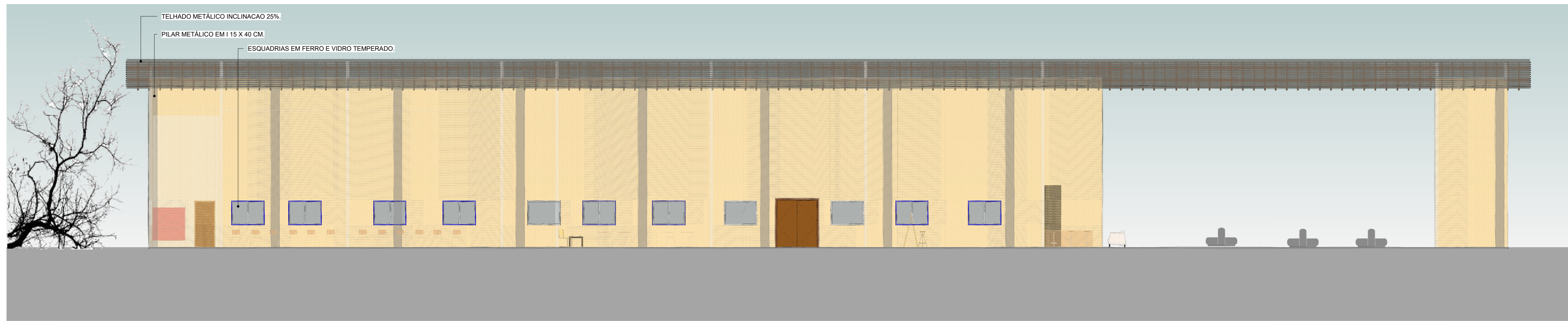
4 Elevation 5 - a ESCALA 1:100