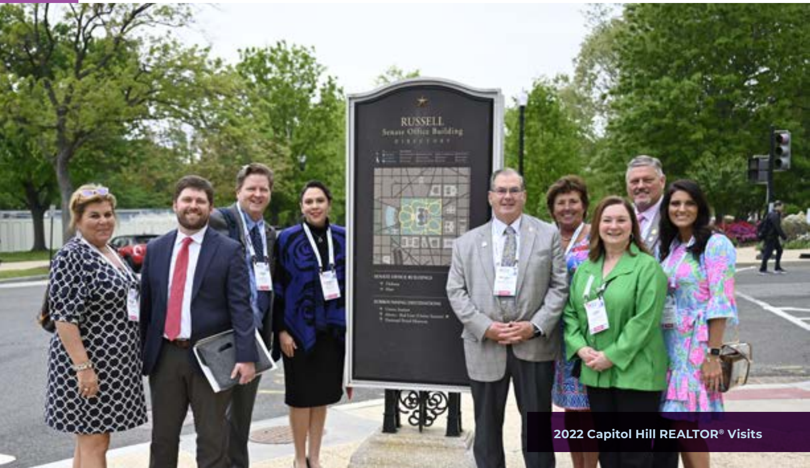
2022 Capitol Hill REALTOR® Visits