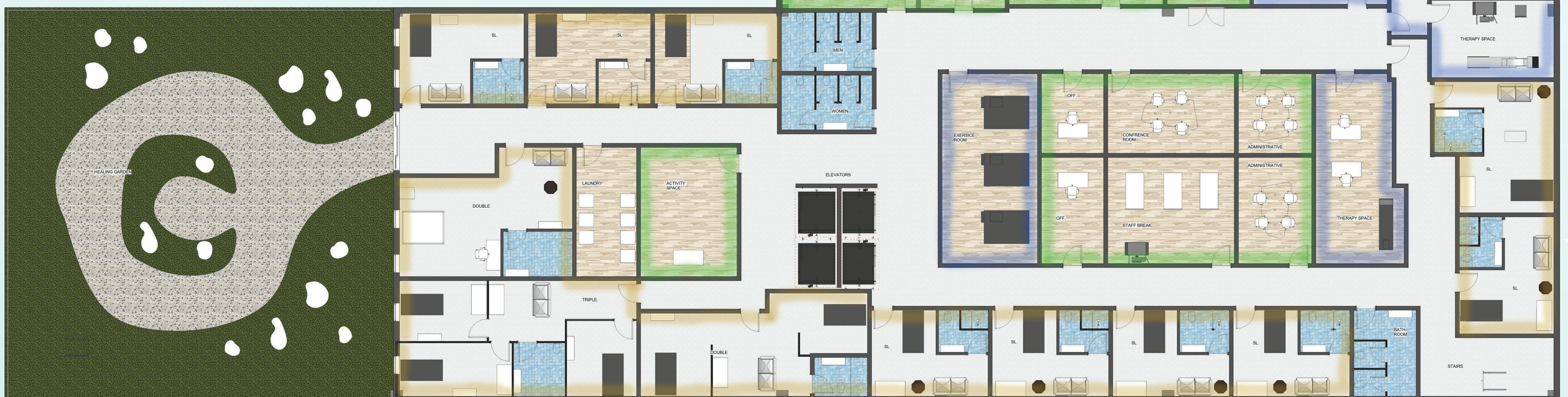
LEVEL TWO FLOOR PLAN

ACUTE / TRAUMA ROOMS FAST TRACK CRITICAL CARE