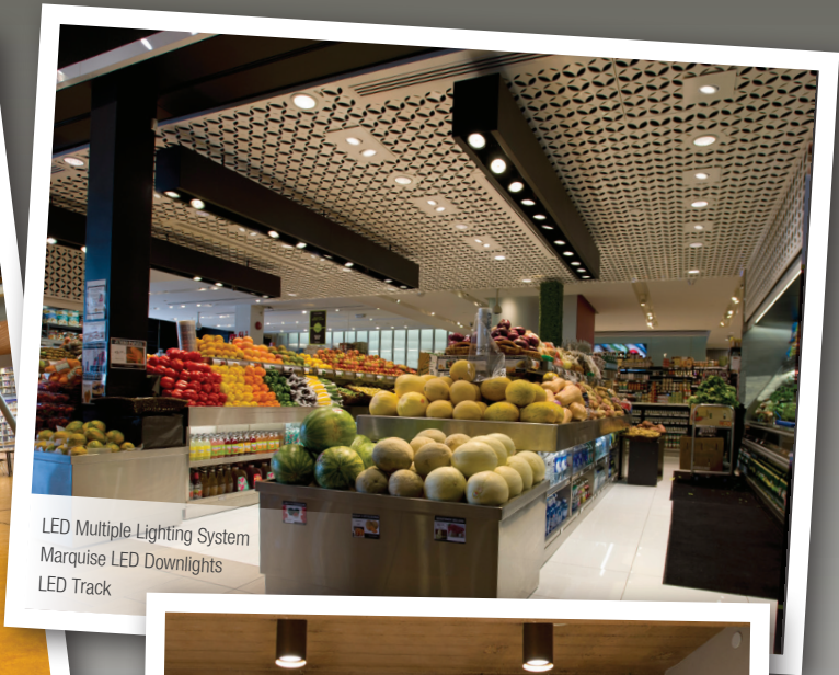
LED Multiple Lighting System Marquise LED Downlights LED Track