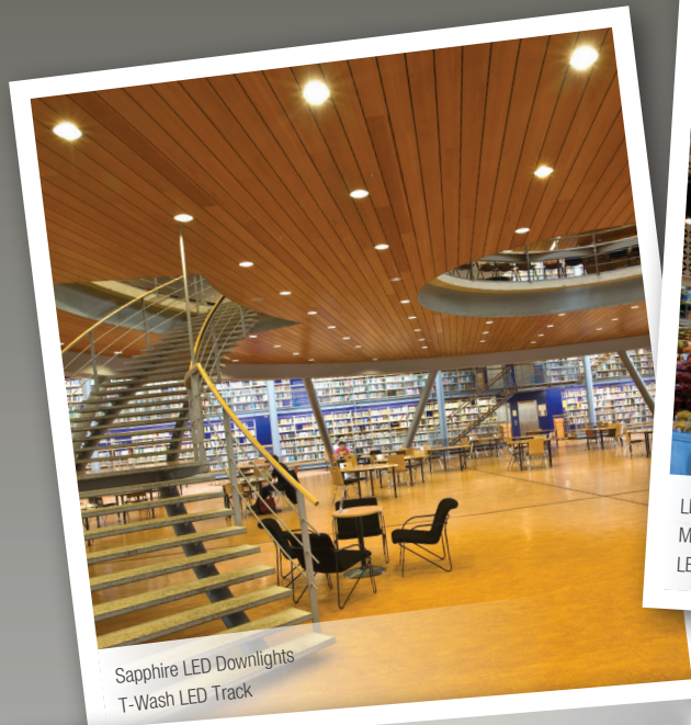
Sapphire LED Downlights T-Wash LED Track