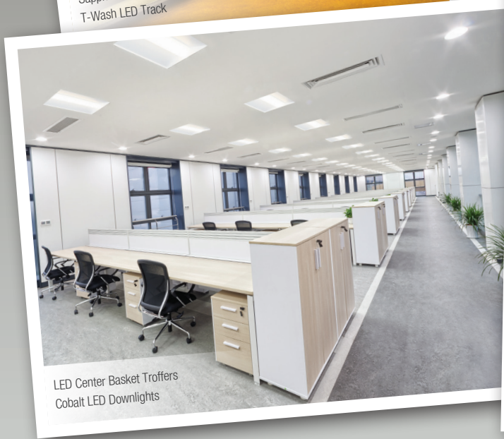
LED Center Basket Troffers Cobalt LED Downlights